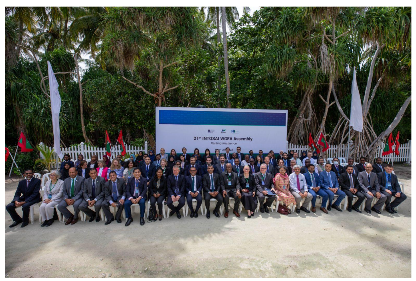
Participants of the 21st INTOSAI WGEA Assembly in the Maldives.

The WGEA hosted its 21st Assembly in July 2022 in the Maldives. The theme of the Assembly was Raising Resilience, which aimed to look at resilience and climate change adaptation from an auditing perspective. The Maldives, being the lowest-lying country in the world, is already affected by the effects of climate change and environmental degradation. This Assembly showcased the willingness for global cooperation to address the imminent issues of small islands as well as the rest of the world. The Assembly was the first hybrid Assembly of the WGEA, gathering 80 participants in-person as well as 200 registered online participants. The WGEA has also released a <u>Seminar Summary on Raising Resilience</u> available to read, as well as a <u>slider on the artistic work</u> present during the Assembly.