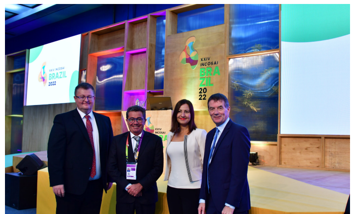
Professional Standards Committee

Goal Committee 1 (Professional Standards):