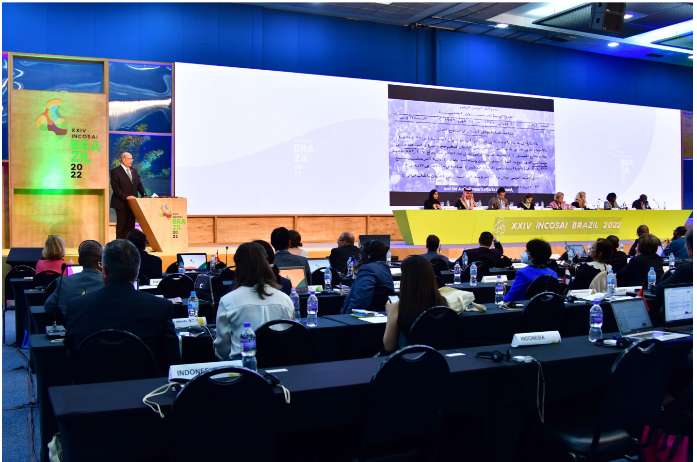
Accountability State Authority (ASA) of Egypt

A number of SAIs were appointed and reappointed to serve as members of the INTOSAI Governing Board. SAI Egypt will serve as the first Vice-Chair of the Governing Board, as the SAI will host the next INCOSAI in 2025.