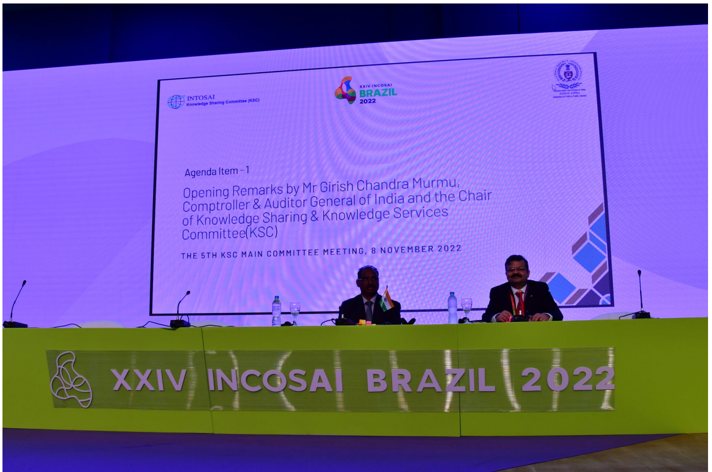
Knowledge Sharing Committee