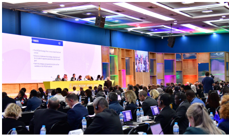
Presentation of the 2023-2028 INTOSAI Strategic Plan

In expressing his appreciation for the work of the Strategic Planning task force during his presentation of the plan at INCOSAI, Comptroller General of the United States Gene L. Dodaro said, “The work of the Task Force was guided by a process firmly grounded in consultation and consensus, building on the best practices identified during the first three strategic plans’ development as well as the Beijing Declaration. A vital part of this process included ensuring that all INTOSAI members had an opportunity to provide input and comment on the plan as it was being developed.”