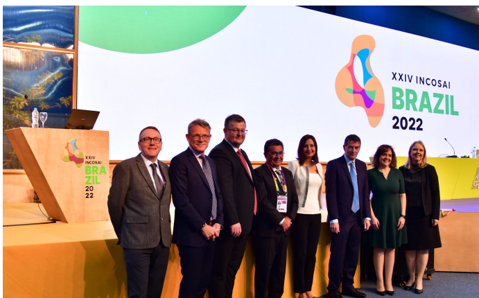
Professional Standards Committee

The new and revised pronouncements endorsed include: