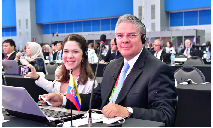
Contraloria General del Estado del Ecuador

A number of SAIs were appointed and reappointed to serve as members of the INTOSAI Governing Board. SAI Egypt will serve as the first Vice-Chair of the Governing Board, as the SAI will host the next INCOSAI in 2025.