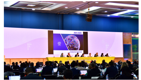
Presentation of the 2023-2028 INTOSAI Strategic Plan