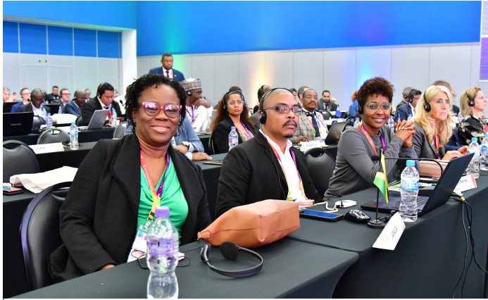
The Auditor General's Department Jamaica

The SAIs of Jamaica and Ecuador were nominated and approved as INTOSAI's auditors for the 2022-2024 financial statements.