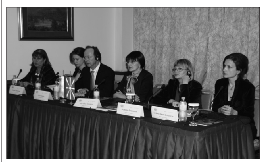
Members of the project team at the public release of the Introduction to Audit Reports manual in Skopje, the former Yugoslav Republic of Macedonia, in November 2012.

The project team comprises representatives from the SAO, NCA, and Westminster Foundation for Democracy. Following meetings held in May 2012 in The Hague and in September 2012 in Skopje, the project team defined the final contents of the manual. It was officially released in November 2012 in Skopie.