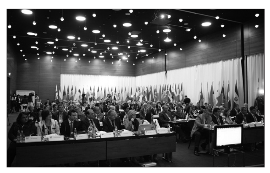
Participants in the EUROSAI-OLACEFS Conference held in Tbilisi, Georgia, in September 2012.

Since 2000, representatives of EUROSAI and OLACEFS have met in a series of conferences designed to facilitate the sharing of experiences and best practices on important public audit issues to foster continuous improvement in the quality of SAI work. The most recent conference coincided with the 20th anniversary of the State Audit Office of Georgia. Hosting the event gave the SAI of Georgia the opportunity to share its own experiences and challenges in establishing itself as an important player in public financial management