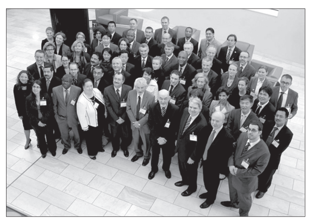
Participants in the meeting of the Steering Committee of the INTOSAI-Donor Cooperation in London in October 2012

The U.K. National Audit Office hosted the 5th Steering Committee meeting of the INTOSAI-Donor Cooperation in London October 18–19, 2012. The meeting had a record attendance and included a ceremony to celebrate the signing of the INTOSAI-Donor memorandum of understanding (MOU) by three additional donors: the Asian Development Bank, the Australian Agency for International Development, and the GAVI Alliance. The MOU now has 19 donor signatories.