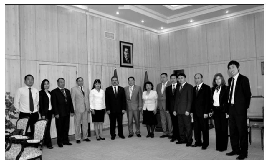
Participants in the value-for-money training program the Turkish SAI provided to staff of the Mongolian SAI.

The programs, which covered theoretical and practical training, gave TCA the opportunity to share the Turkish experience regarding VFM audit. The program covered a range of audit topics, such as principles and procedures of performance audit, a comparison of performance audit and performance evaluation, understanding the entity and its environment, selection of performance audit topics, issue analysis, main question and subquestions, developing audit criteria, methods of gathering evidence, interviews and focus groups, field work, developing audit conclusions and recommendations, documentation of audit evidence, reporting, the followup stage of performance audit, IT audit, and audit management.