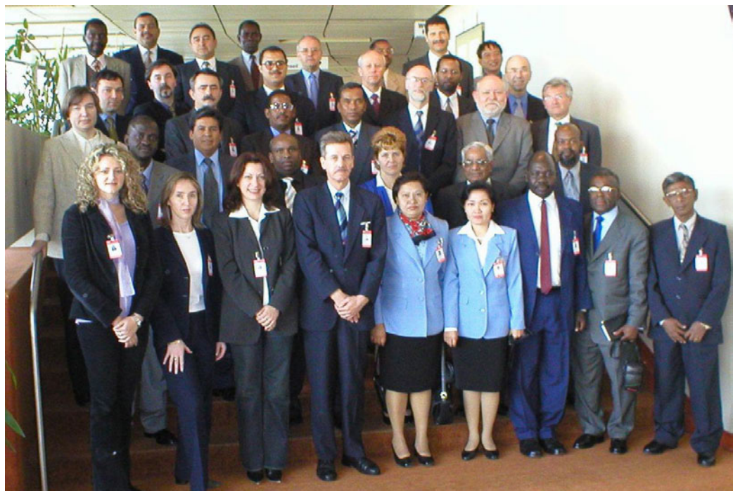
16th UN/INTOSAI Seminar participants in Vienna.

The discussions following the keynote speeches gave the participants the opportunity to exchange ideas and identify key aspects of education audits. Several working groups at the seminar afforded the participants a setting for sharing their experiences in a smaller forum, going into more detail on issues brought to their attention during the discussions, and arriving at conclusions and recommendations.