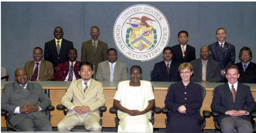
GAO's 2003 International Fellows

For more information, contact the US General Accounting Office, by telephone: ++202-512-4707, fax:++202-512-4021 or by email at SPEL@GAO.GOV.