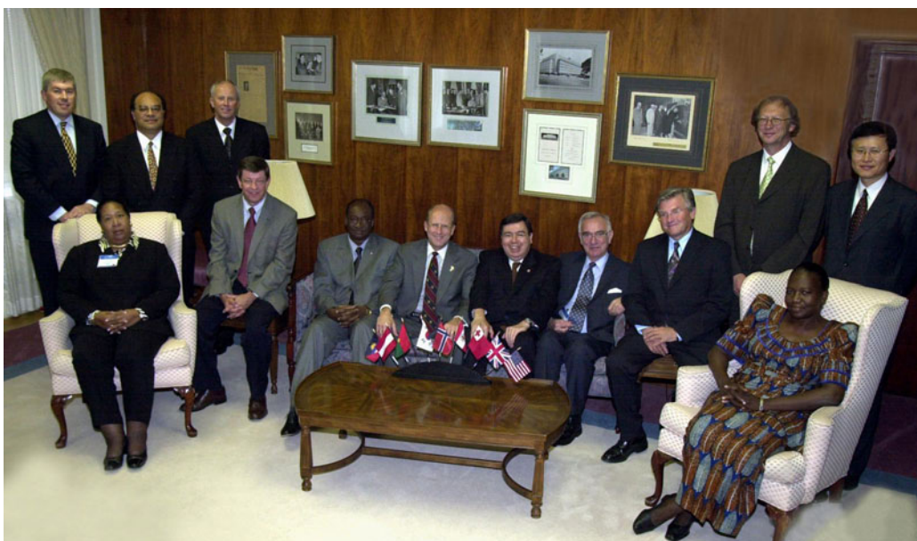
Strategic Planning Task Force members at April 2003 meeting in Washington, D.C.

The 2-day gathering followed up on the first meeting of the task force in April 2002, at which the task force developed the framework for a strategic plan to guide the work of INTOSAI. The draft strategic planning framework was circulated to INTOSAI's 185 member countries for review and comment and approved by INTOSAI's governing board in October 2002. The goal of the April 2003 meeting was to further develop the strategic goals outlined in the framework so that a "straw" draft strategic plan can be developed. After a round of review and comment, the draft strategic plan will be submitted to INTOSAI's governing board in October 2003 for approval. The final plan will be voted upon at INTOSAI's next congress, set for October 2004 in Budapest, Hungary.