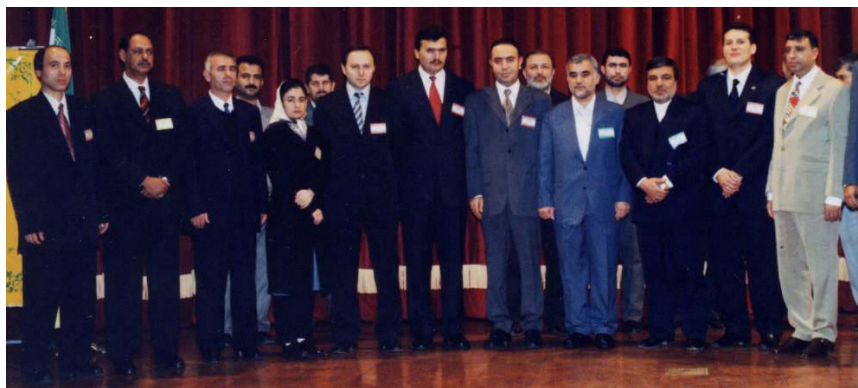
Participants at second ECOSAI regional training course.

The GAB's participation in a variety of local and overseas sessions on auditing, management, EDP processes, and the English language was also part of the training plan. GAB staff have also completed the first phase of their 2003 in-house training.