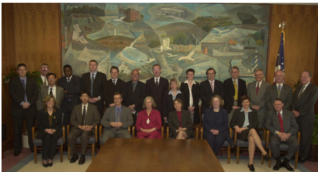
Auditing Standards Committee Members in Washington

In May 2003, the ASC Working Group will invite all INTOSAI members to nominate experts to the Reference Panel. The experts who are selected will work with the IAASB Task Forces and on other related tasks. In order to ensure a truly global perspective, the Working Group hopes to receive the contributions of SAIs from around the world and from different auditing systems.