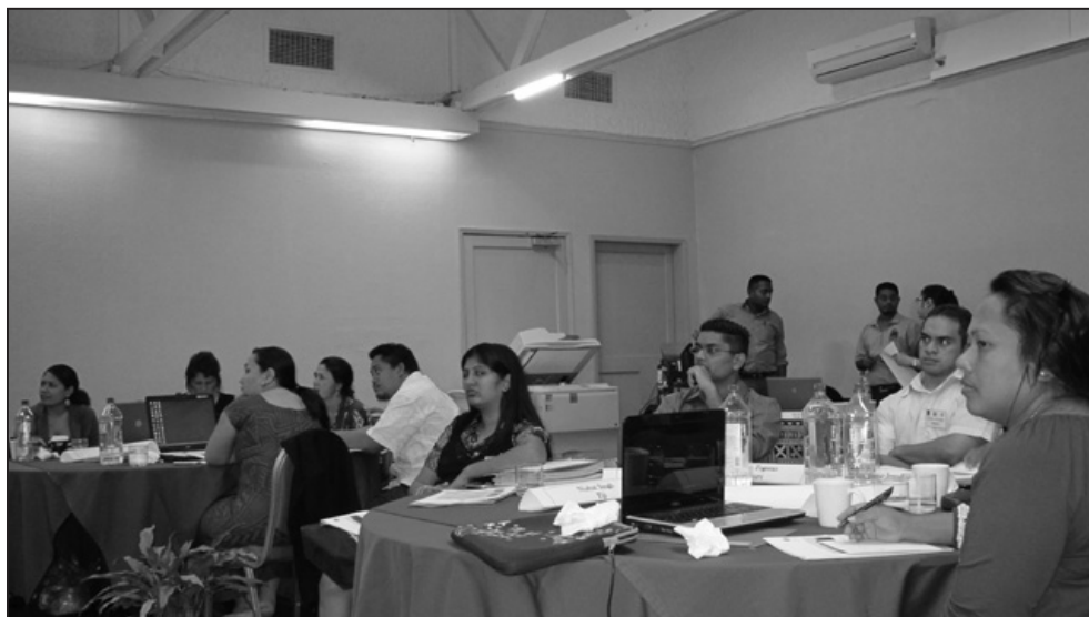
Participants at the IDI/PASAI cooperative audits on fisheries planning meeting.

IDI has agreed to support PASAI in delivering a third cooperative audit focusing on fisheries after the successful completion of two cooperative audits on solid waste management and access to safe drinking water. Team members from the participating SAIs held an audit planning meeting in August 2011 and are to conduct field audits, analyze data, and draft audit reports before reconvening for a feedback meeting early in 2012.