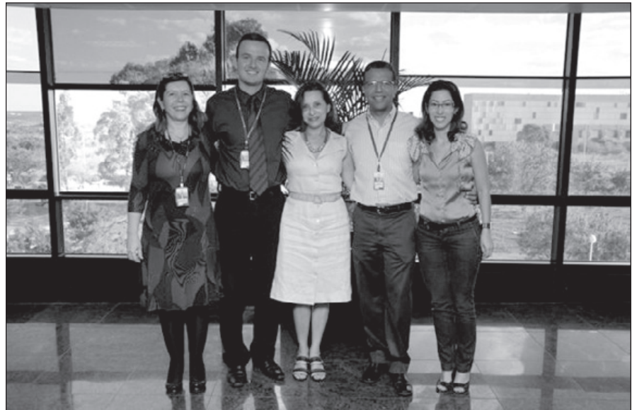
Course instructors for the Brazilian e-learning course on performance auditing.

E-mail: arint@tcu.gov.br Web site: www.tcu.gov.br