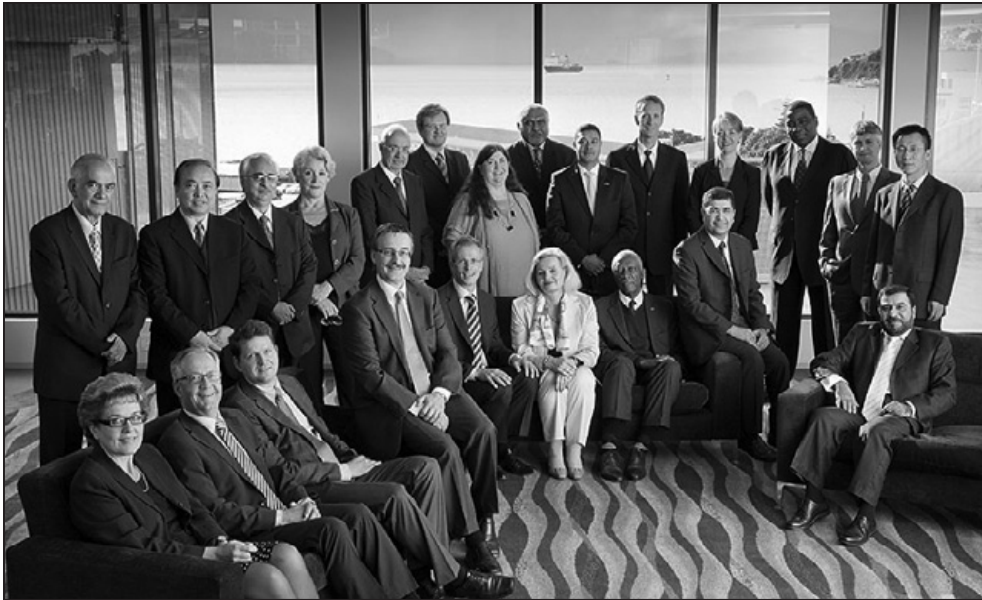
Participants in the June 2011 PSC Steering Committee meeting in New Zealand.