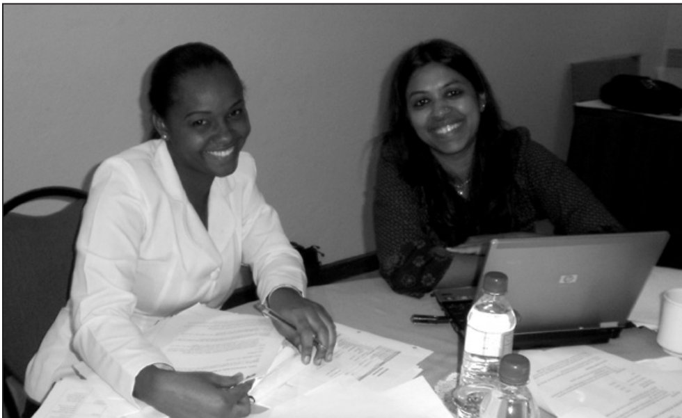
Participants in the IDI/CAROSAI design meeting.

A Program on Risk-based Approach to Financial Auditing was launched in 2010 to follow up on the Program on Quality Assurance in Financial Auditing delivered in 2009. Audit teams from six CAROSAI members participated in developing guidelines for risk-based financial audits and carried out pilot audits based on the guidelines. The program culminated with an IDI/CAROSAI guide, A Risk-Based Approach to Financial Auditing . In 2011, the program will be delivered again for those CAROSAI members that were not able to participate in the first round. IDI staff and regional experts met for a design meeting in July 2011 to develop comprehensive courseware, which will be used to deliver a workshop on a risk-based approach to financial audits by the end of 2011.