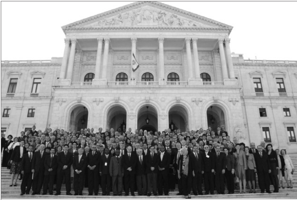
Participants in the VIII EUROSAI Congress in Lisbon.

The presentations of congress speakers also contributed to fruitful debates, which were, in turn, enriched by participant interactions. The participants included representatives of 47 EUROSAI member SAIs and 20 observers from the public audit community (including other representatives of INTOSAI and its regional organizations). All had the opportunity to discuss issues of common interest and major importance that were raised in the context of the congress themes.