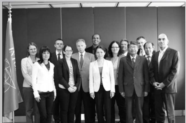
Members of the INTOSAI subcommittee on peer review.

INTOSAI's peer review efforts are coordinated by subcommittee 3 of the Capacity Building Committee. The Journal wishes to express its appreciation to the subcommittee, chaired by the SAI of Germany, for its invaluable assistance in preparing this issue.