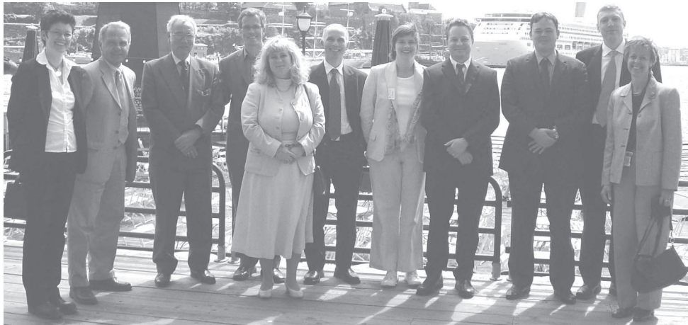
INTOSAI representatives from Norway, Sweden, and the United Kingdom at the June 2004 meeting in Oslo.