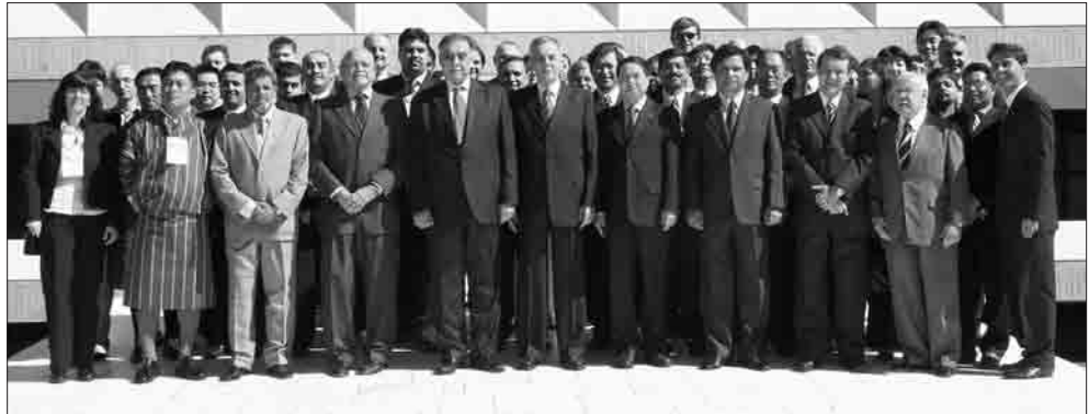
Delegates to the May 2006 IT Audit Committee meeting in Brasilia.

The committee decided to undertake a series of new projects on IT governance, e-government risks, IT tools for electronic audit papers, use of the SAP software package in public administration, and auditing application/software development. The committee also decided that the 16th IT Audit Committee meeting will be in Oman in March 2007 and that the 17th meeting will be in Japan in 2008. The 5th Performance Auditing Seminar, on IT governance, will be held before the 16th meeting and will be coordinated by the SAI of the United States.