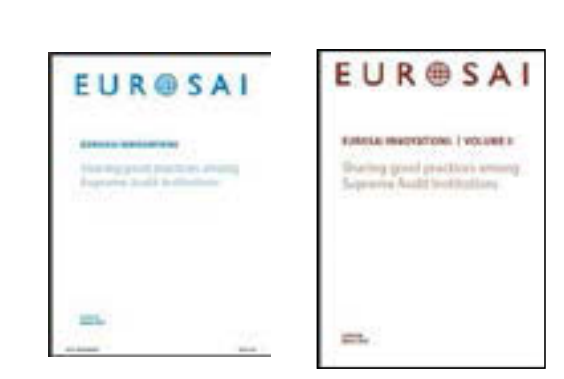
EUROSAI Strategic Plan's capacity building site at <u>www.eurosai.org/en/strategic-plan/</u> <u>capacity-building/</u>