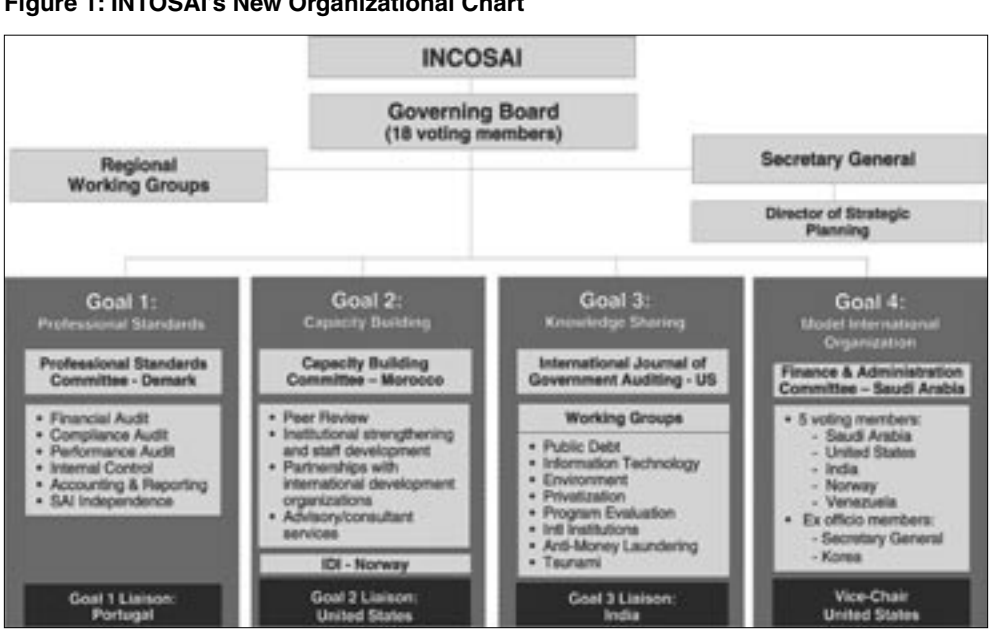
Figure 1: INTOSAI's New Organizational Chart