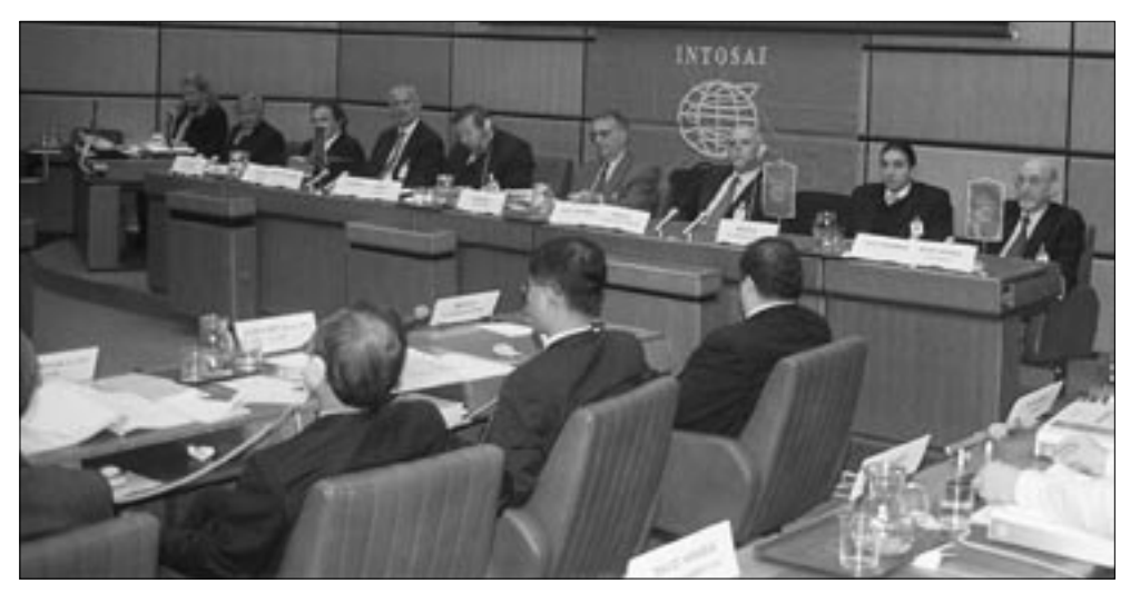
SAI heads and staff from Hungary, Mexico, Saudi Arabia, and Austria at the head table during the Governing Board meeting in Vienna in November 2005.

The influence of INTOSAI's strategic plan was evident at the INTOSAI Governing Board's annual meeting in Vienna on November 10-11, 2005. The meeting agenda was structured to reflect the four goals in the strategic plan (see new INTOSAI organization chart on p. 6) and, under the able leadership of Dr. Arpad Kovacs, the board continued to make progress in implementing the plan's strategies and recommendations.