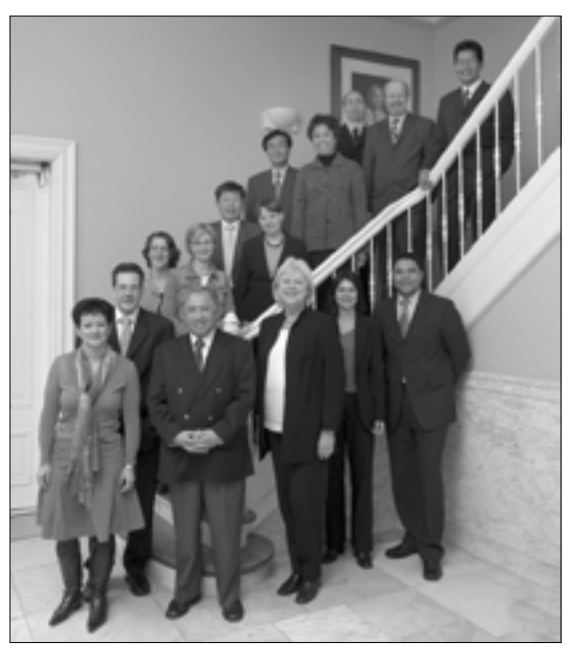
Members of the Task Force on Accountability and Audit of Disaster-Related Aid at their December 2005 meeting in The Hague.

Other issues discussed at the December meeting included funding for the initiative and establishing contacts with other relevant organizations, such as the United