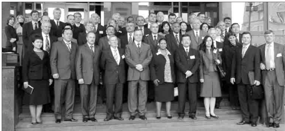
Delegates to the meeting of the Task Force on the Fight against International Money Laundering.

The Accounts Chamber of the Russian Federation organized an international symposium to discuss developments in the work of the INTOSAI Task Force on the Fight against International Money Laundering. The symposium focused on the role of SAIs in developing and implementing national policies and procedures to combat international money laundering, as well as the contributions SAIs themselves can make. Participants focused on two subthemes: