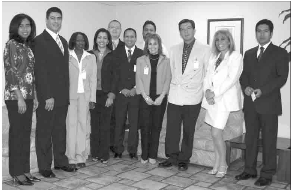
IDI and OLACEFS staff for INTOSAI’s first regional e-learning workshop.