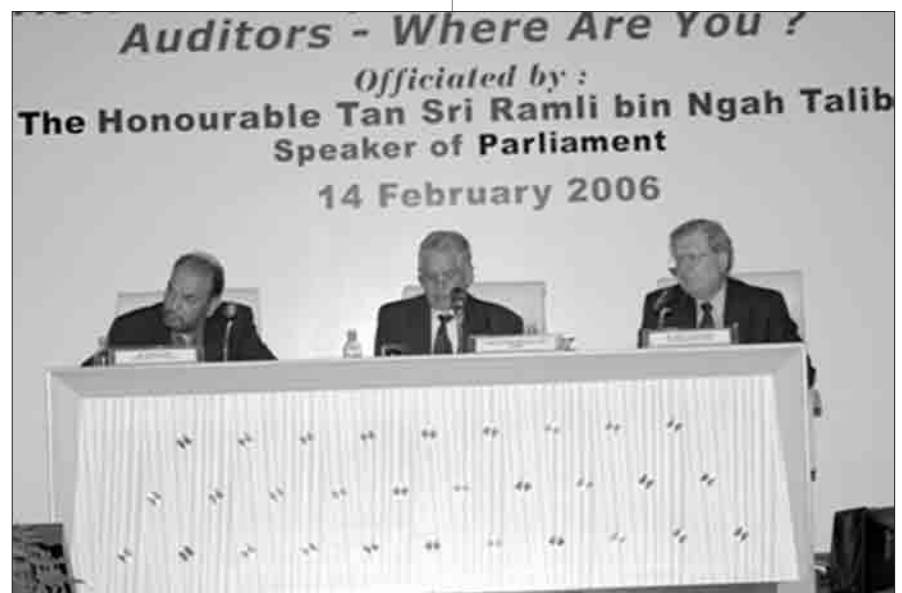
Speakers at the Malaysian National Audit Convention.