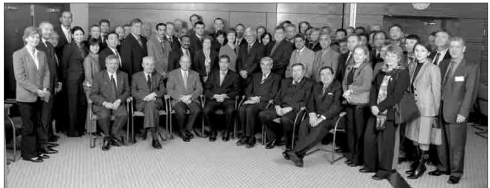
Delegates to the CBC's inaugural meeting in London in March 2006.