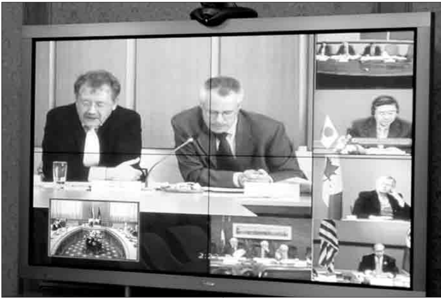
Participants in the June 2006 videoconference of G8 country SAIs.

presidency of the G8 in 2006: energy security, infectious disease control, and education. The discussions focused on strategies for promoting international collaboration and cooperation among SAIs. In addition to Mr. Stepashin, the auditors general from Canada, Germany, Italy, Japan, the United Kingdom, and the United States participated in the videoconference.