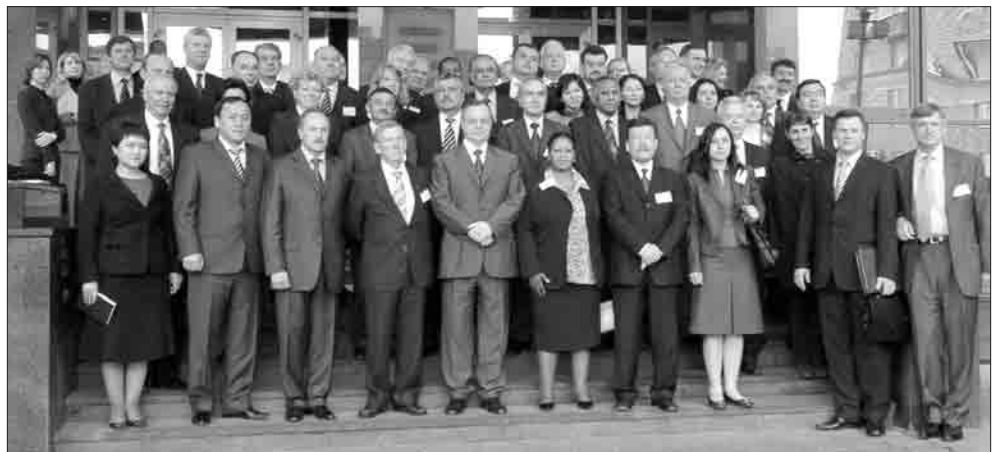
Delegates to the meeting of the Task Force on the Fight against International Money Laundering.

The Accounts Chamber of the Russian Federation organized an international symposium to discuss developments in the work of the INTOSAI Task Force on the Fight against International Money Laundering. The symposium focused on the role of SAIs in developing and implementing national policies and procedures to combat international money laundering, as well as the contributions SAIs themselves can make. Participants focused on two subthemes: