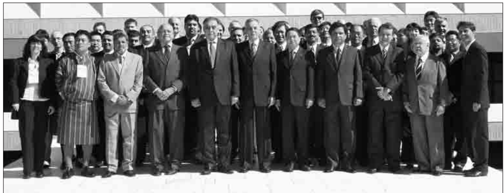
Delegates to the May 2006 IT Audit Committee meeting in Brasilia.

The committee decided to undertake a series of new projects on IT governance, e-government risks, IT tools for electronic audit papers, use of the SAP software package in public administration, and auditing application/software development. The committee also decided that the 16th IT Audit Committee meeting will be in Oman in March 2007 and that the 17th meeting will be in Japan in 2008. The 5th Performance Auditing Seminar, on IT governance, will be held before the 16th meeting and will be coordinated by the SAI of the United States.